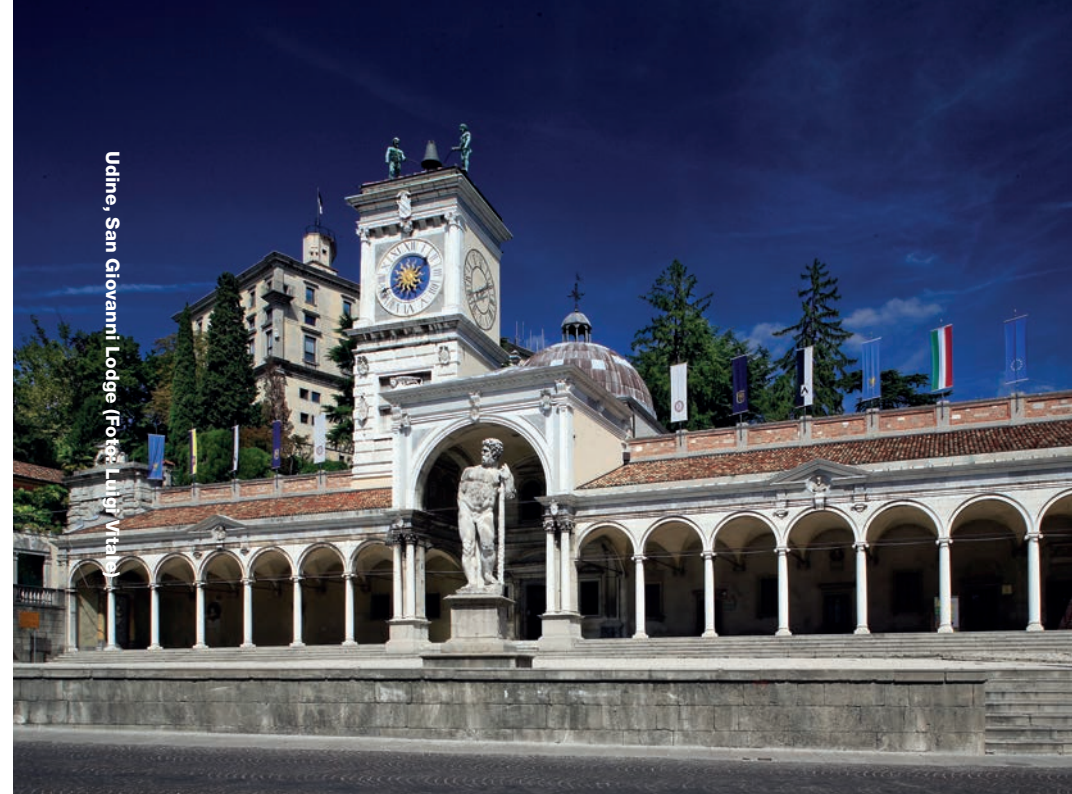
Udine, San Giovanni Lodge

Another legend tells the story of a lake monster, who threatened people and eventually would eat them. One day a saint, who was a skilled warrior, walked by and killed the monster. It is said that what the archive of the Madonna delle Grazie monastery guards, is one rib of that dangerous beast.