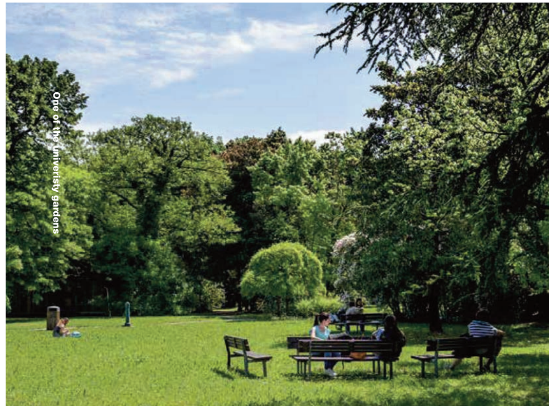
One of the university gardens