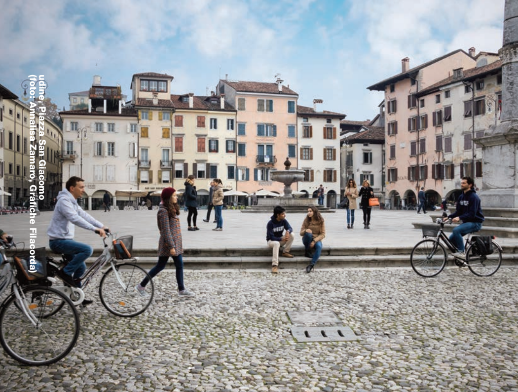
udine, Piazza San Giacomo