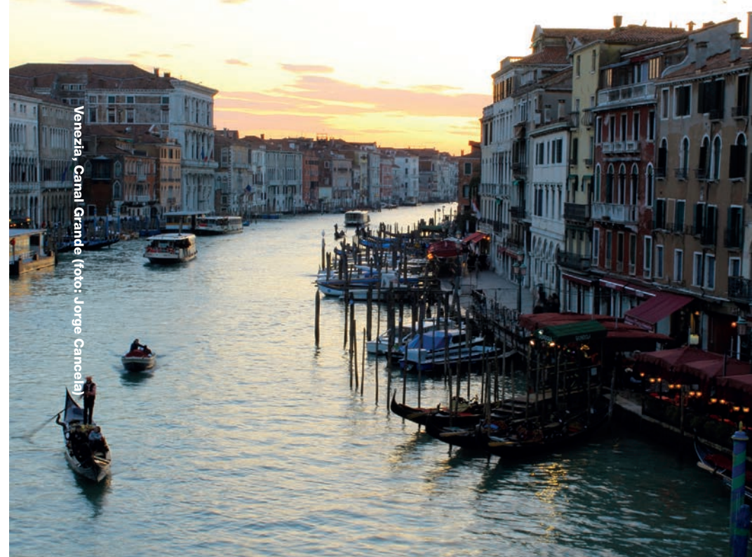
Venezia, Canal Grande

Venice is world known for its beauty and charm. The city is basically an open-air museum, wherever you go you are surrounded by arts and building which are typical of the Venetian style. If you want to see the real Venice you need to lose yourself between the so called “Calle”, the name given to the Venetian streets, and experience the beauty of this one-of-a-kind-city. Venice is not famous only for its beauty but also for what it has to offer to tourists such as museum, festivals and events.