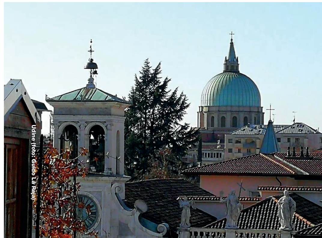
Udine