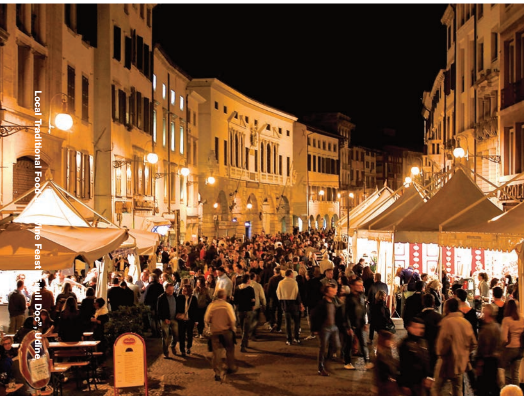
Local Traditional Food "The Feast of the Doc", Udine