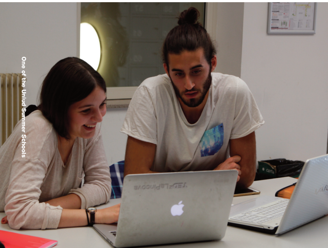
One of the Uniid Summer Schools