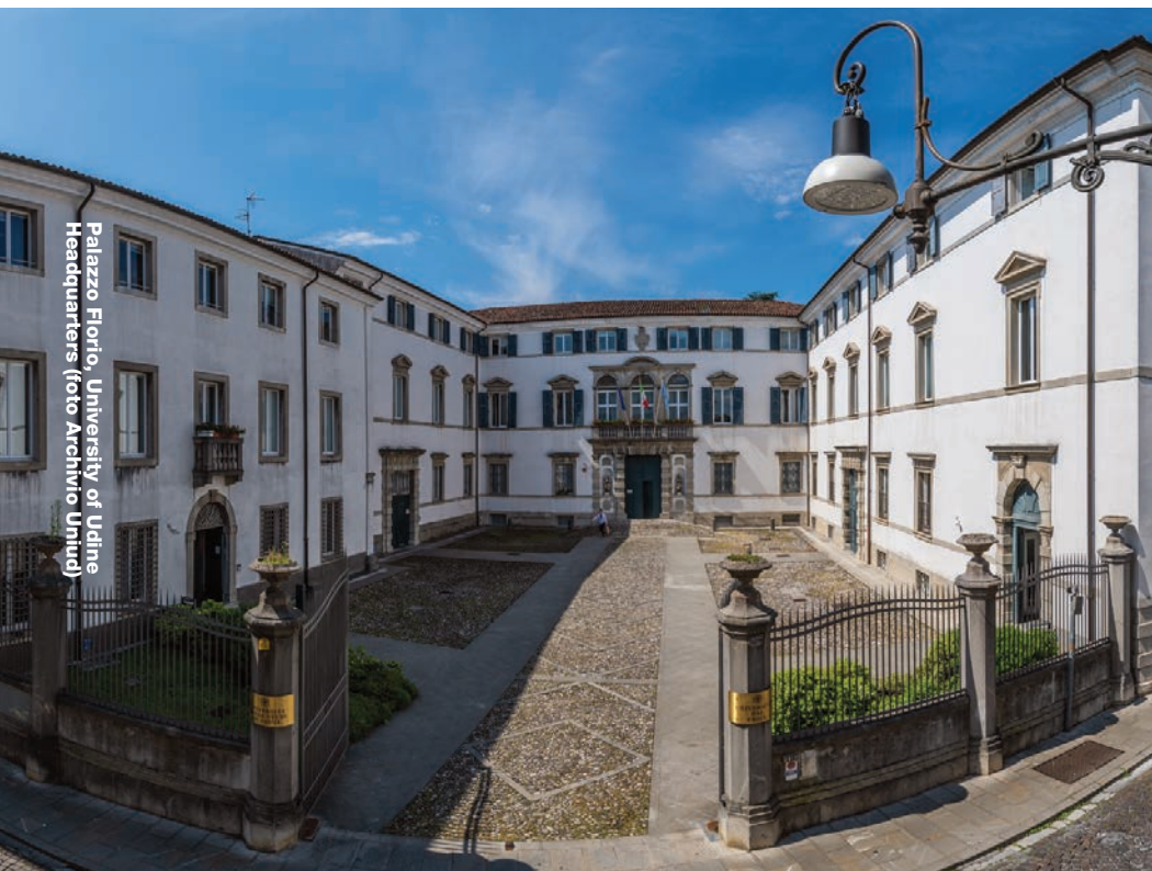
Palazzo Florio, University of Udine Headquarters