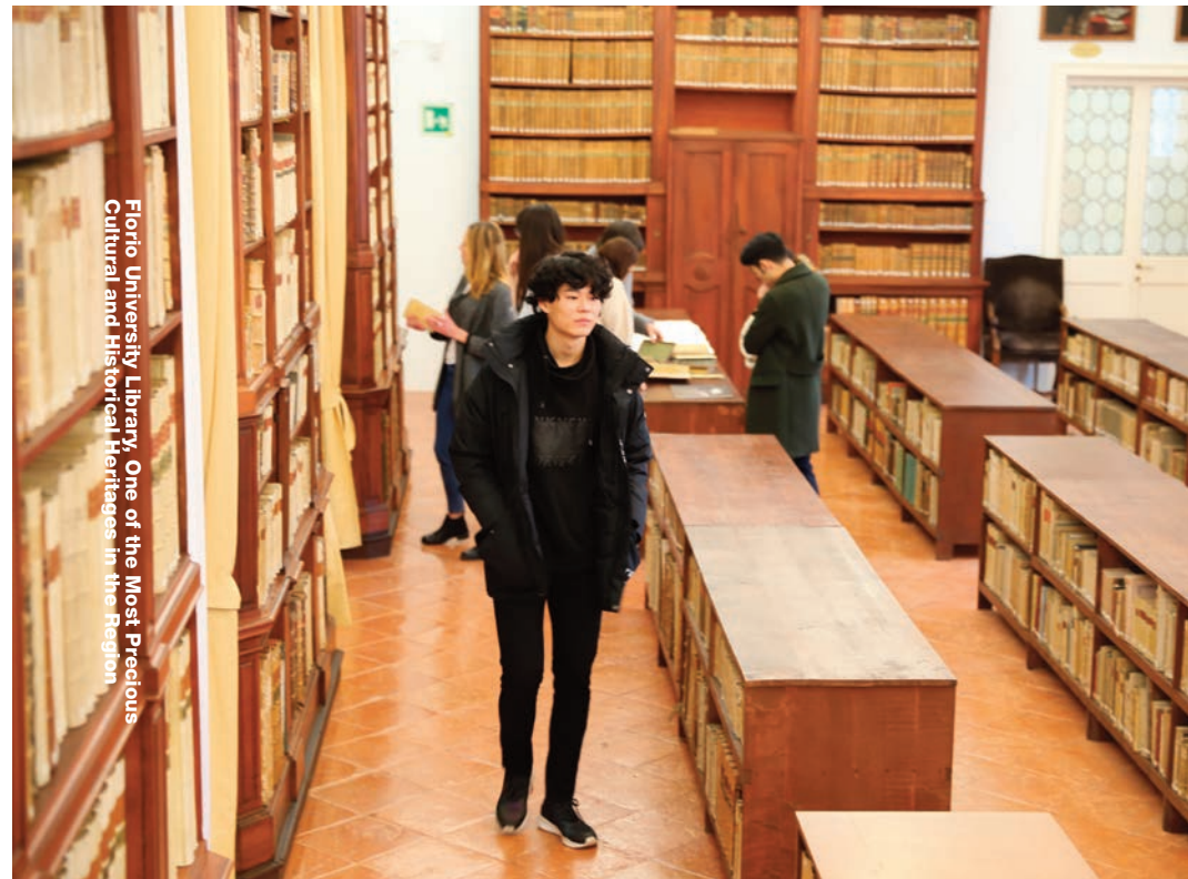
Florio University Library, One of the Most Precious Cultural and Historical Heritages in the Region