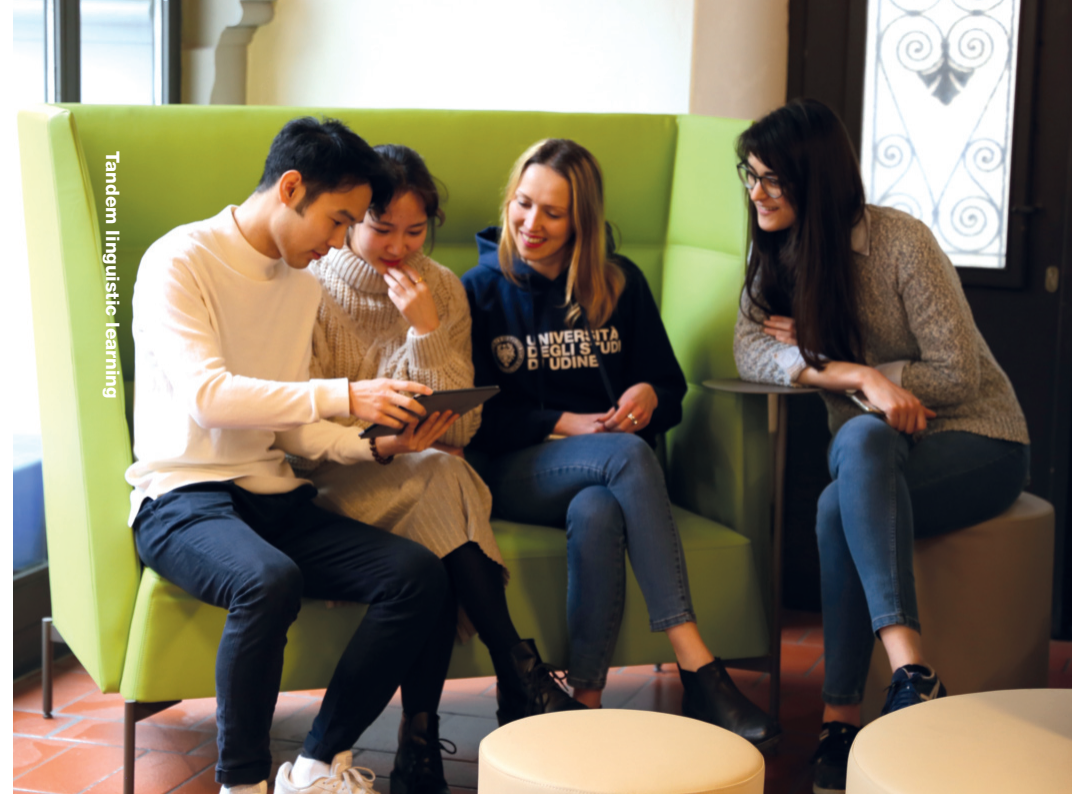
Tandem linguistic learning

The main reason why I decided to study in Udine was because here I could fully focus on my studies, as Udine is a quiet and welcoming city. This experience was extremely pleasant because the University offers accommodation and canteen services, and this means that I did not have to care for them only on my own. Despite the fact that Udine is not a very big city, you can find everything that you might need in your everyday life right here. From Udine it is very easy to go to other fascinating cities like, for example, Venice or Trieste. Also, in Udine there are always entertainment, cultural events, and international activities. Initially, Chinese students may have difficulties in understanding lessons, because of our cultural and linguistic differences. But I found extremely helpful CLAV's language class, where I could learn other foreign languages as well. After studying for 3 years, I have learnt a big deal about Italian language and culture. Now Udine is like a second home to me.