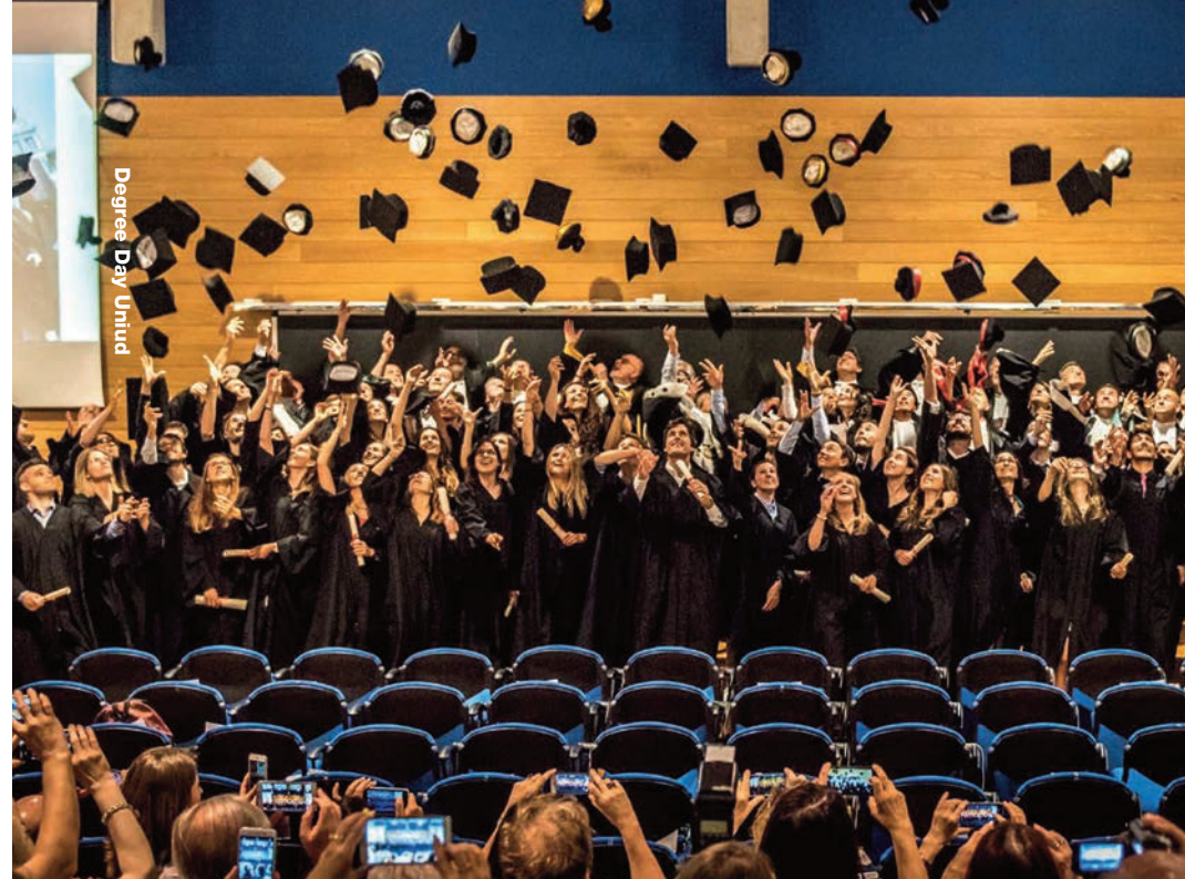
Degree Day Unitud