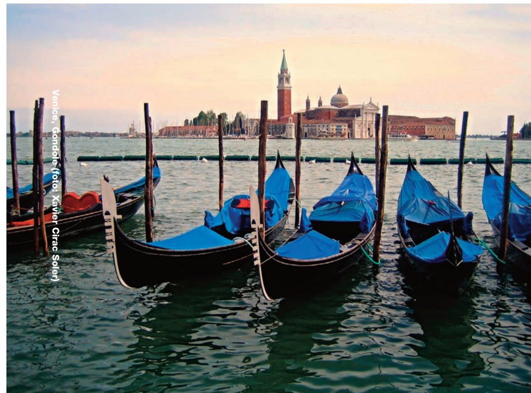
Venice, gondole