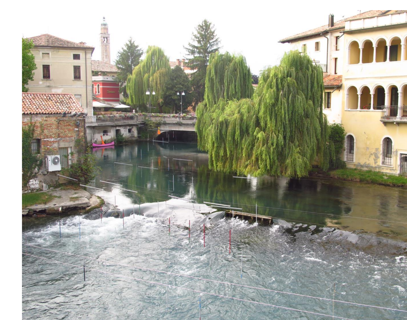
The Livenza river in Sacile