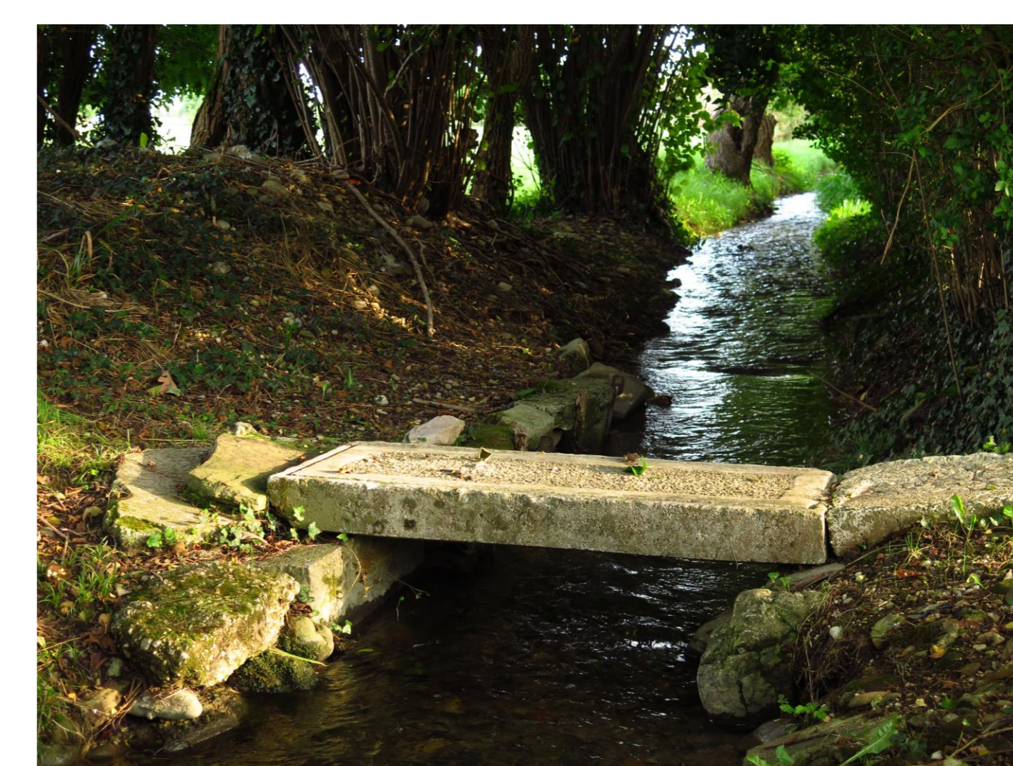
The Roiello di Pradamano river

The best framework for enabling place-making and enhancing a sense of place is to develop river contracts within a process that includes a high degree of participation, allowing citizens to move from being passive recipients of plans territorial actors towards becoming territorial actors.